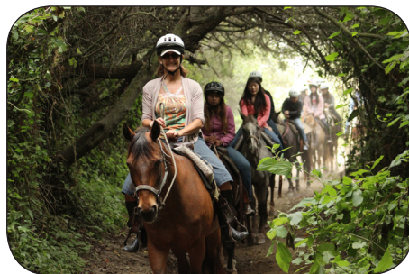
Friendships enjoy a horseback riding adventure.

Please visit friendsforyouth.org for a complete list of our recognitions and accomplishments. We share these milestones and awards with the nearly 2,000 Friendships whose relationships we have created and supported and with you—our generous supporters. Thank you for believing in the power of mentoring.